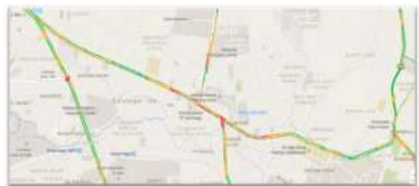
Fig 2 :Bowenpally-Balanagar Stretch