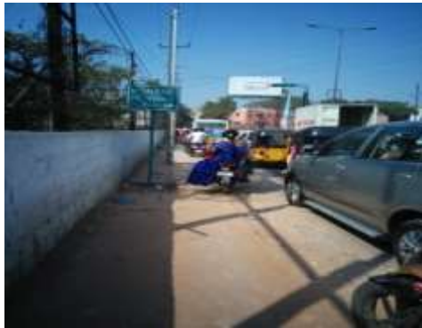
Fig 3: Footpath at Bowenpally