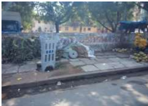
Fig 3: Footpath occupied by local vendors