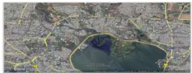
Fig 1: Begumpet Stretch

The study area for understanding traffic calming in Hyderabad city is Begumpet stretch. The reasons behind selecting this stretch for study are poor road condition and regular traffic congestion in Begumpet stretch. The study area is shown in fig 1.